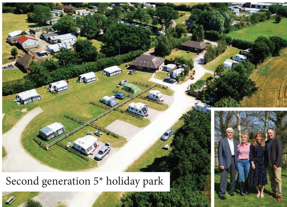
Second generation 5* holiday park

Family run and owned for over 50 years, our dedicated team of friendly staff take great pleasure in creating a truly memorable stay. Here at Broadhembury, you will find everything to make the perfect holiday, whether you are looking for that special family holiday, relaxing couples break, or simply a stop-over on the way to the Continent.